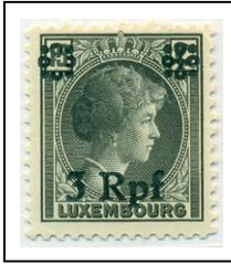
N17 type III variation (10.4mm)