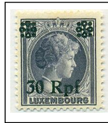
N27 type II variation (10mm)